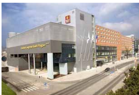
Site of ISOPP XII – Clarion Congress Hotel Prague, Prague, Czech Republic

Visit the symposium website on www.isopp2010.com for all details of registration and hotel bookings.