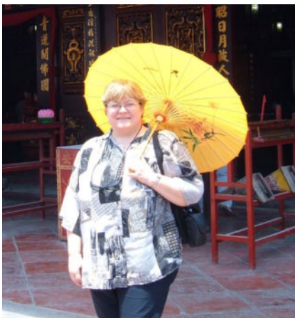
(Here I am enjoying some sunshine in KL after ISOPP X)