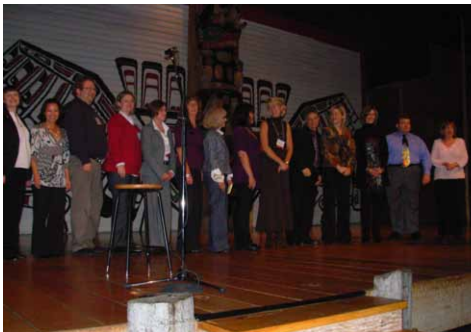
NOPS Organising Committee - how many ISOPP members can you spot?

For the third year in a row CAPHO hosted an evening dinner for delegates and guests. From bagpipes in Halifax to cowboys in Calgary, NOPS moved this year to the sophistication of chamber music, and fine dining at the National Museum of Man.