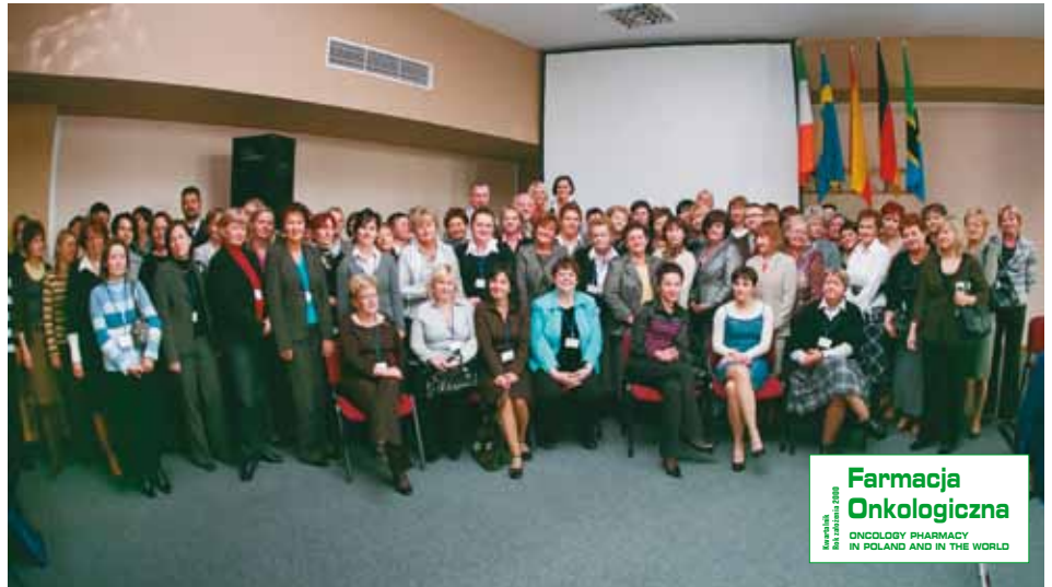
Polish Oncology Meeting Group Picture, Warsaw 2009.