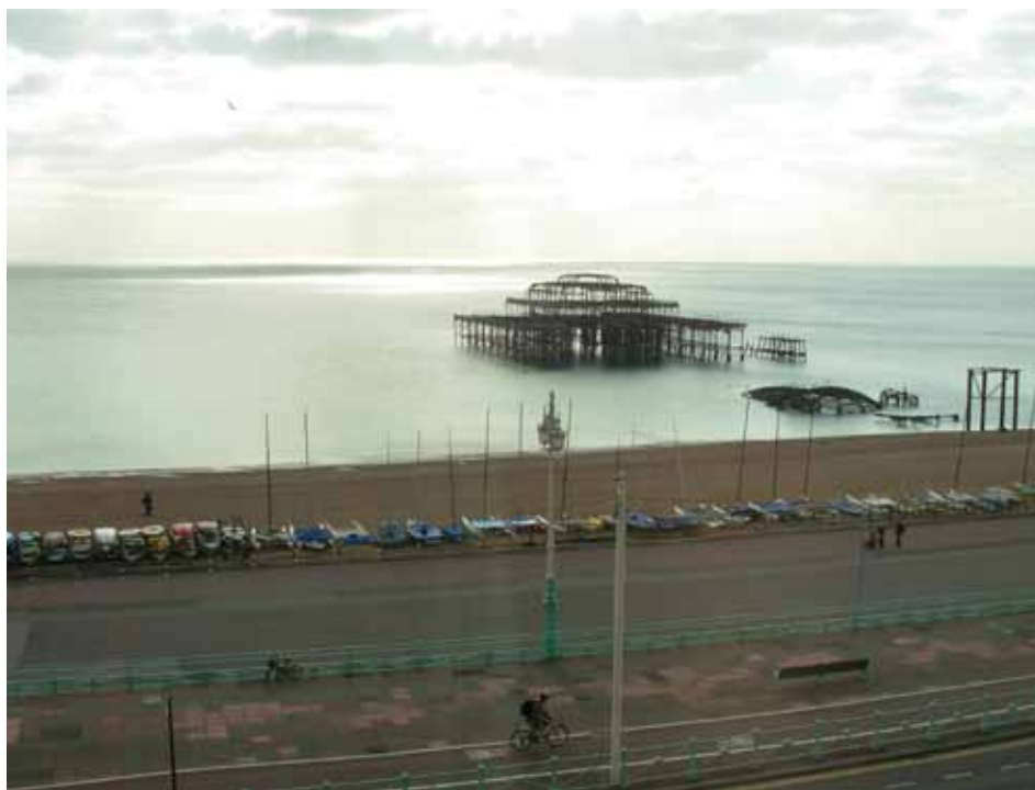
BOPA venue held at the seaside city of Brighton

The clinical update on Melanoma was delivered by an optimistic speaker who highlighted that in the past the treatment of metastatic melanoma has been far from satisfactory with little impact on overall survival. However, with the substantial advances that have been made in understanding the genetic changes associated with this disease, new classes of drugs have been designed to target these mutations. One of these classes targets the RAS/RAF/MEK pathway which is up-regulated in melanoma and is responsible for proliferation and resistance to apoptosis. This pathway can be turned on by activating mutations in NRAS or BRAF which has been linked to disease progression. PLX4032 -a selective B-RAF kinase inhibitor- is in early phase II studies, and is a promising new drug.